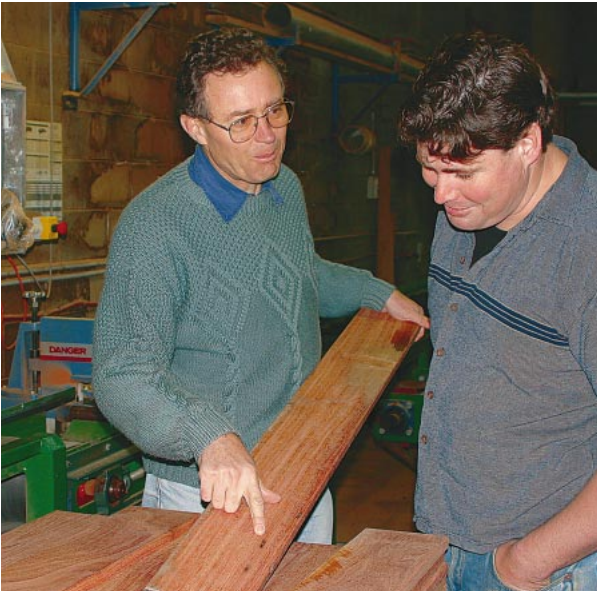
Accurately graded to approved standards.