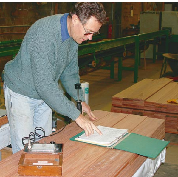
Seasoned to the correct moisture content.