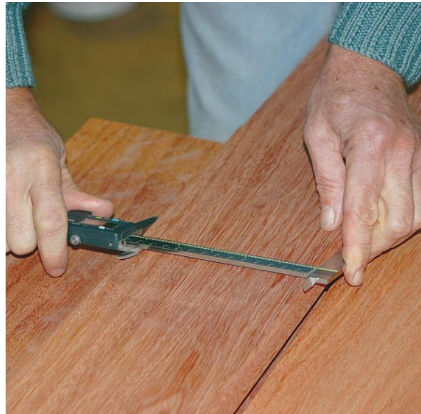
Accurately sawn or machined to size.