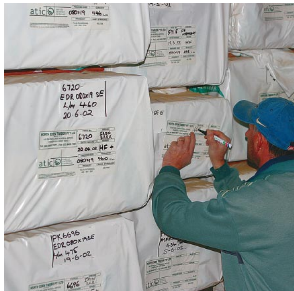
Correctly packaged and labelled with the grade, compliance standards and producer's name.

Supplied by manufacturers who have a pride in their product quality and craftsmanship!